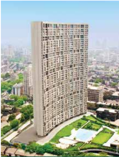
Planet Godrej Mahalaxmi

Bringing Godrej Group's 127-year legacy of innovation to real estate, we blend trust, advanced design and technology in every development. Our focus on sustainability, thoughtful design and uncompromising quality, aims to redefine residential landscapes across various micro-markets.