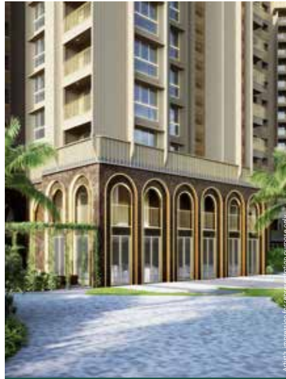
Godrej RKS Chembur