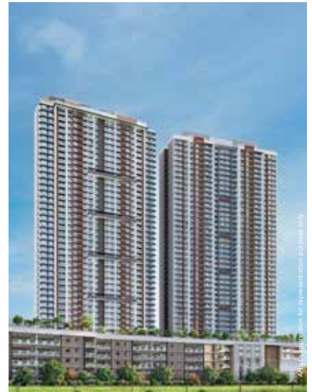
Godrej Horizon Dadar-Wadala

The projects are registered with Maharashtra RERA as: 'Godrej RKS' bearing MahaRERA No. P51800023915, 'Godrej Five Gardens' bearing MahaRERA No. P51900048424, Godrej Sky Terraces on MAHARERA bearing Registration No. P51800053882 'Godrej Horizon' Phase I and 'Godrej Horizon' Phase II bearing MahaRERA numbers as P51900034851 and P51900049757 respectively, available on MahaRERA website ( https://maharera.mahaonline.gov.in ). The project is registered as 'Godrej Avenue Eleven' under MahaRERA No. P51900005216 available at ( https://maharera.mahaonline.gov.in ). The name is currently being updated. The project is being developed by Godrej Residency Pvt. Ltd ("Developer") wherein Godrej Group Entities and Neelkamal Realtors Tower Private Limited are its shareholders. Neelkamal Realtors Tower Private Limited is a wholly owned subsidiary of DB Realty Ltd. Godrej Properties Limited is also acting as the Development Manager for the Project. The Developer is constructing 2 buildings being building Tower A and Tower B (MahaRERA No. P51900006299) with Tower A comprising of 66 upper floors.