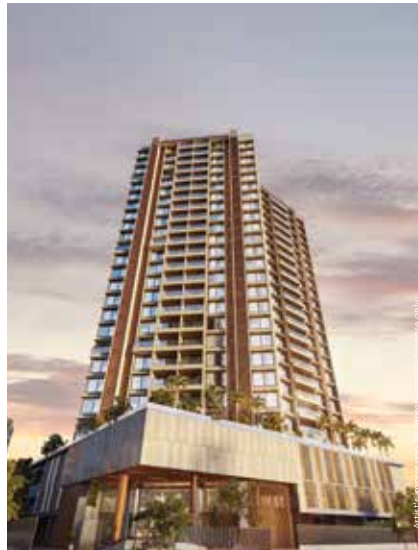
Godrej Sky Terraces Chembur