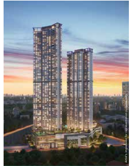
Godrej Avenue Eleven Mahalaxmi