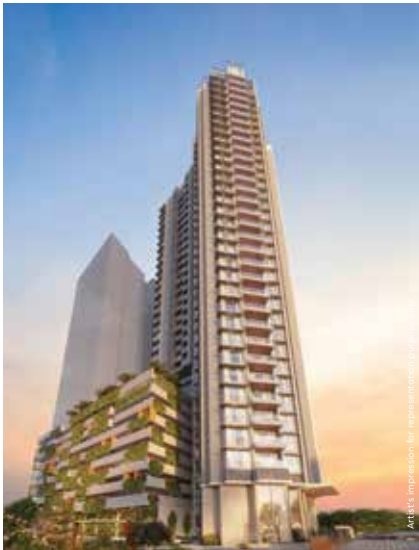
Godrej Five Gardens Matunga